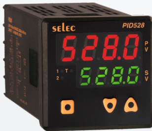
48 x 48mm